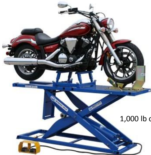
model# QML01A 1,000 lb capacity air operated motorcycle/ATV lift