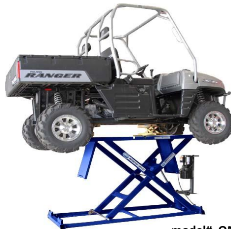
model# QML02E 2,000 lb capacity electric/hydraulic operated motorcycle/UTV lift